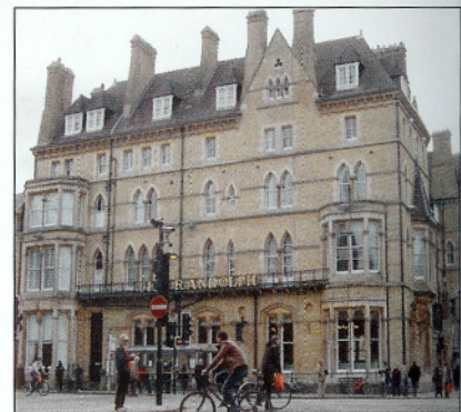
The Randolph Hotel, which often features in 'Lewis'

A very knowledgeable tour guide walked us around many of